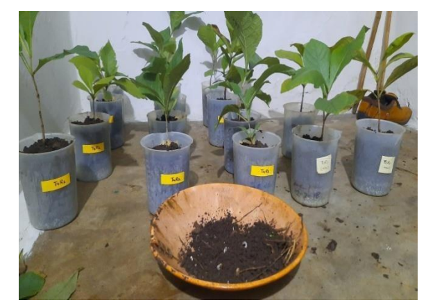
Conducted soil based bioassay of target bio pesticides against white grub