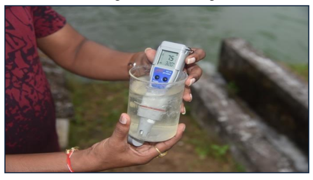
On site water quality assessment (pH) of treated sewage water at Padmavathikhani Underground Mines, SCCL Telangana