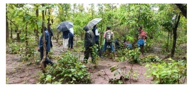
Enumeration of vegetation

However, appreciable regeneration of Shorea robusta and Diospyros melanoxylon was observed in lantana removed forest areas while Ougeinia oojeinensis, Anogeissus latifolia, Grewia tiliaefolia, Phyllanthus emblica, and Pterocarpus marsupium were found to be the newly regenerated species in the treated area.