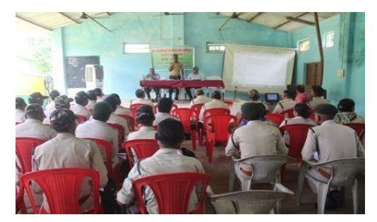
Interaction on eco-friendly management of white grub with officials of SFD