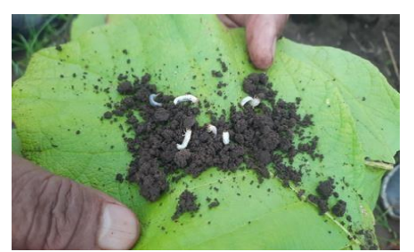
White grubs collected from teak nursey bed at Kanchangaon, M.P.