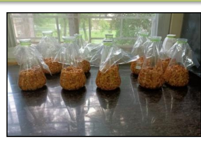
Fermentation under anaerobic conditions with different concentrations of fermenter