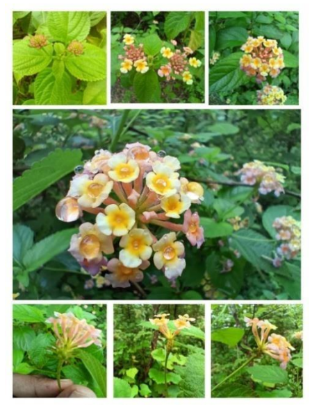
Flowering of Lantana camara

The TFRI project team conducted a tour at the end of July in Bastar Forest Division, Chhattisgarh. We observed that Lantana camara was in flowering stage and fruiting stage. It was observed that one fruit stalk has the potential to produce an average of 25 to 33 seeds per stalk. Large number of seeds per stalk per inflorescence is a direct function of its invasion potential into new habitats