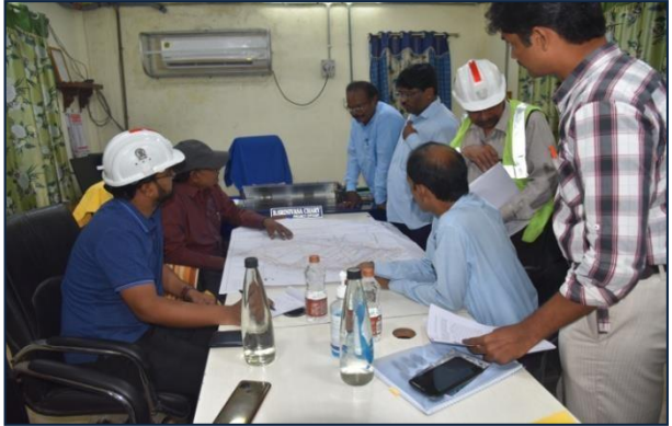
Discussions and deliberations with Mining Officials of Manuguru OCP, Telangana

To maintain the ecology and environmental health of coal mining area, Indian Council of Forestry Research and Education (ICFRE) has been awarded projects from multiple coal mining companies to undertake Third-party auditing of their respective coal mines spread across the country. As a member of the ICFRE team of experts, the conditions laid down in the Environmental Clearances (EC) approval for mitigation of environmental pollution were reviewed, the compliance with the project approval conditions and other warranted approvals of the mine were assessed, the existing levels of air, water and noise pollution with respect to the laid down standards were reviewed through on site inspection, and recommendations which were necessary for implementation of measures as stipulated in the EC so as to improve environmental performance of the mine were provided and individual Environmental Audit Report pertaining to the domain of air quality monitoring, noise quality monitoring and water quality (surface water, ground water, sewage water and effluents) monitoring were prepared and submitted to ICFRE for 5 different mines vis-à-vis Dipka Open Cast Project Mines (OCP), South Eastern Coalfields Limited, Chhattisgarh, Sharda Highwall Mines and Dhanpuri OCP mines of South Eastern Coalfields Limited (SECL), Madhya Pradesh, and Manuguru OCP and Padmavathi Khani Underground Mines of Singareni Collieries Company Limited (SCCL), Telangana.