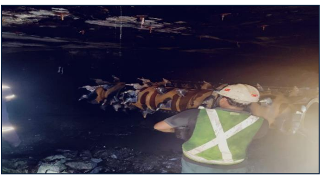
Inspection of Dust suppression measures undertaken at the source end (underground) of Padmavathi khani UG Mines, SCCL Telangana