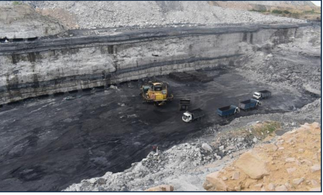
On-site field inspection of Sharda Highwall Mines, SECL Madhya Pradesh