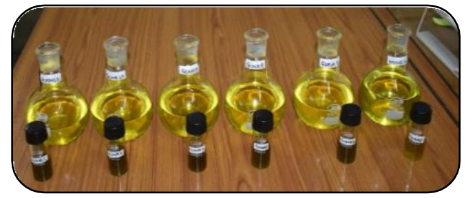
Oil extraction from Neem seeds samples