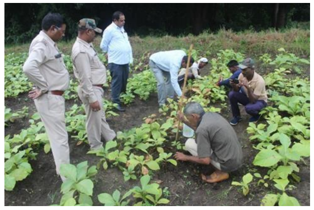
Collection of White grubs from infested fields

Soil based bioassay was carried out at Kanchagaon teak nursery, Mandla (M.P) to determine the effect of mahua and Jatropha seed extracts against white grub attacking teak seedlings. Results showed that, Jatropha curcas seed extracts @1 % concentration has 10.0 percent grub mortality, whereas Madhuca indica seed extracts showed 7.5 percent grub mortality at 72 hours after treatment.