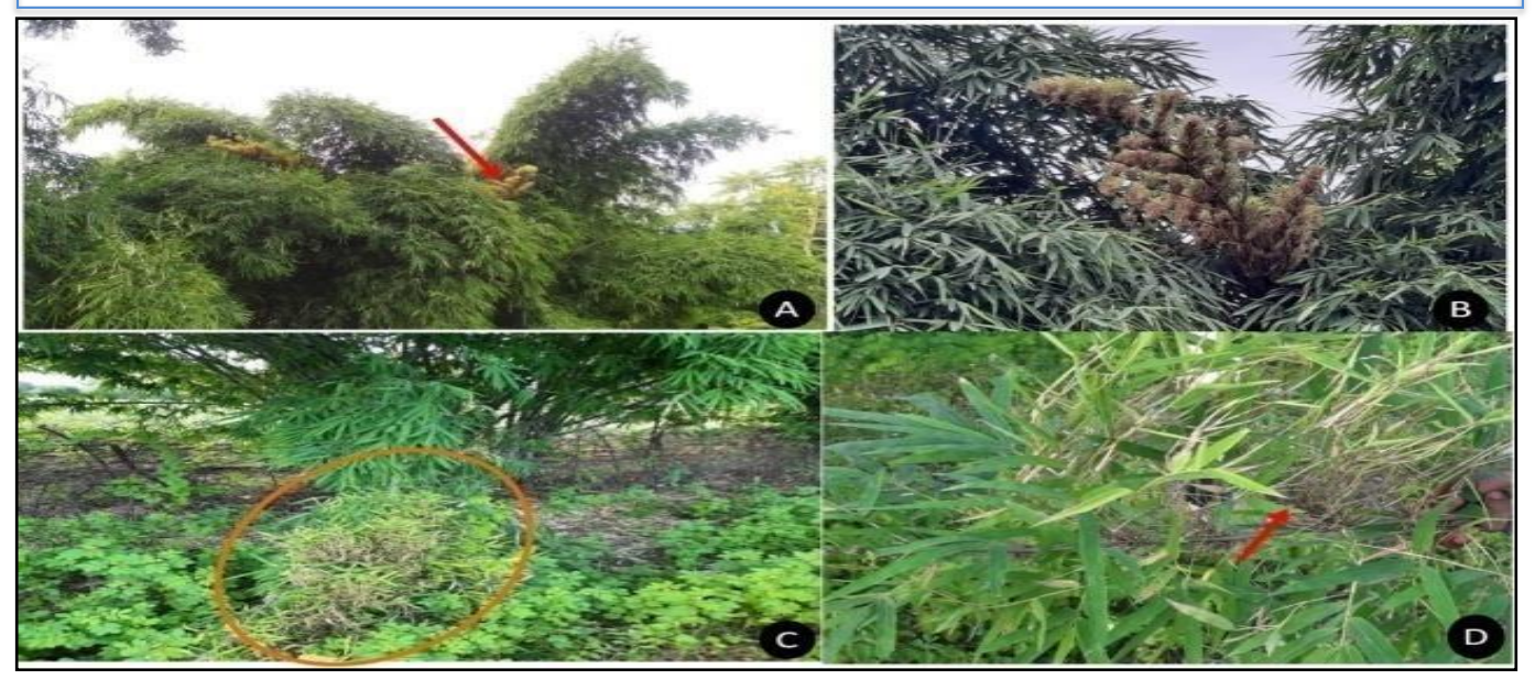
Infected D. strictus plant showing typical witches' broom / Phyllody symptoms associated with Candidatus Phytoplasma at Amravati, India. Proliferative branches on infected plant (A), single branch (B &C) and node (D) with profuse tillering

It is important to constantly examine both the asymptomatic and symptomatic plants, alternative host plants in the bamboo ecosystem and the surrounding areas, and insect vectors, as new variants of the phytoplasma are constantly emerging. Diagnosis of bamboo species for phytoplasma diseases and its management of phytoplasma insect vectors will help to reduce its vulnerability to this disease.