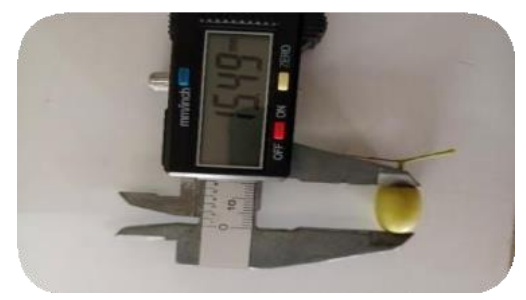
Morphological measurement of Neem fruits

Collection of Neem fruits and De-pulping of Neem fruits