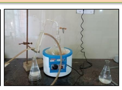
Distillation of fermented Mahua flowers