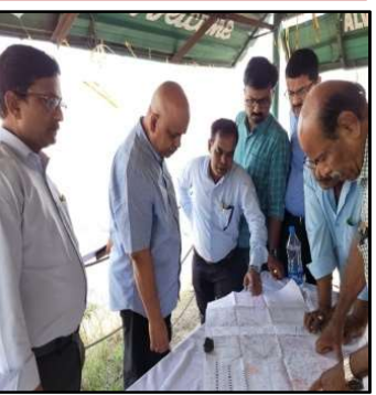
Cluster VII Mines of BCCL Dhanbad, Jharkhand