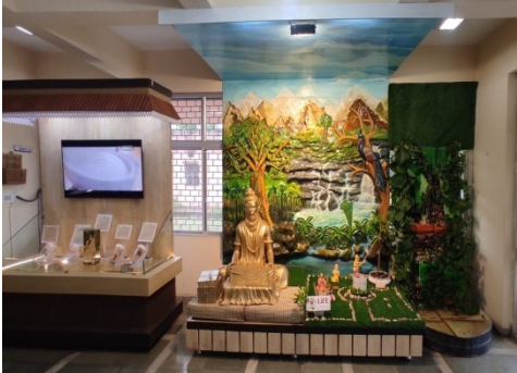
Non Timber Forest Produce (NTFP) Demonstration Centre Interpretation Centre - Museum