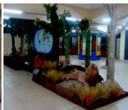
Interpretation Centre - Museum