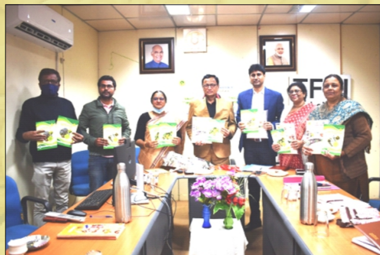
1 st National Conference on Value Addition & Marketing of NTFPs - 2021