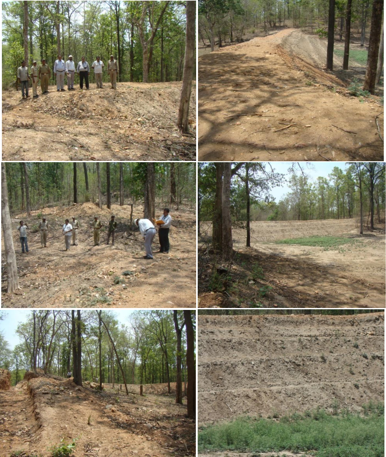
Fig. 5: Construction of check dam/pond - Site 4