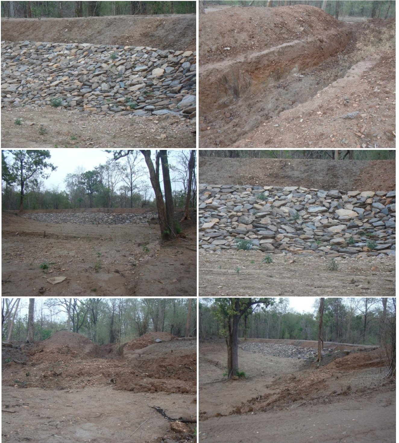
Fig. 7: Construction of check dam/pond - Site 6