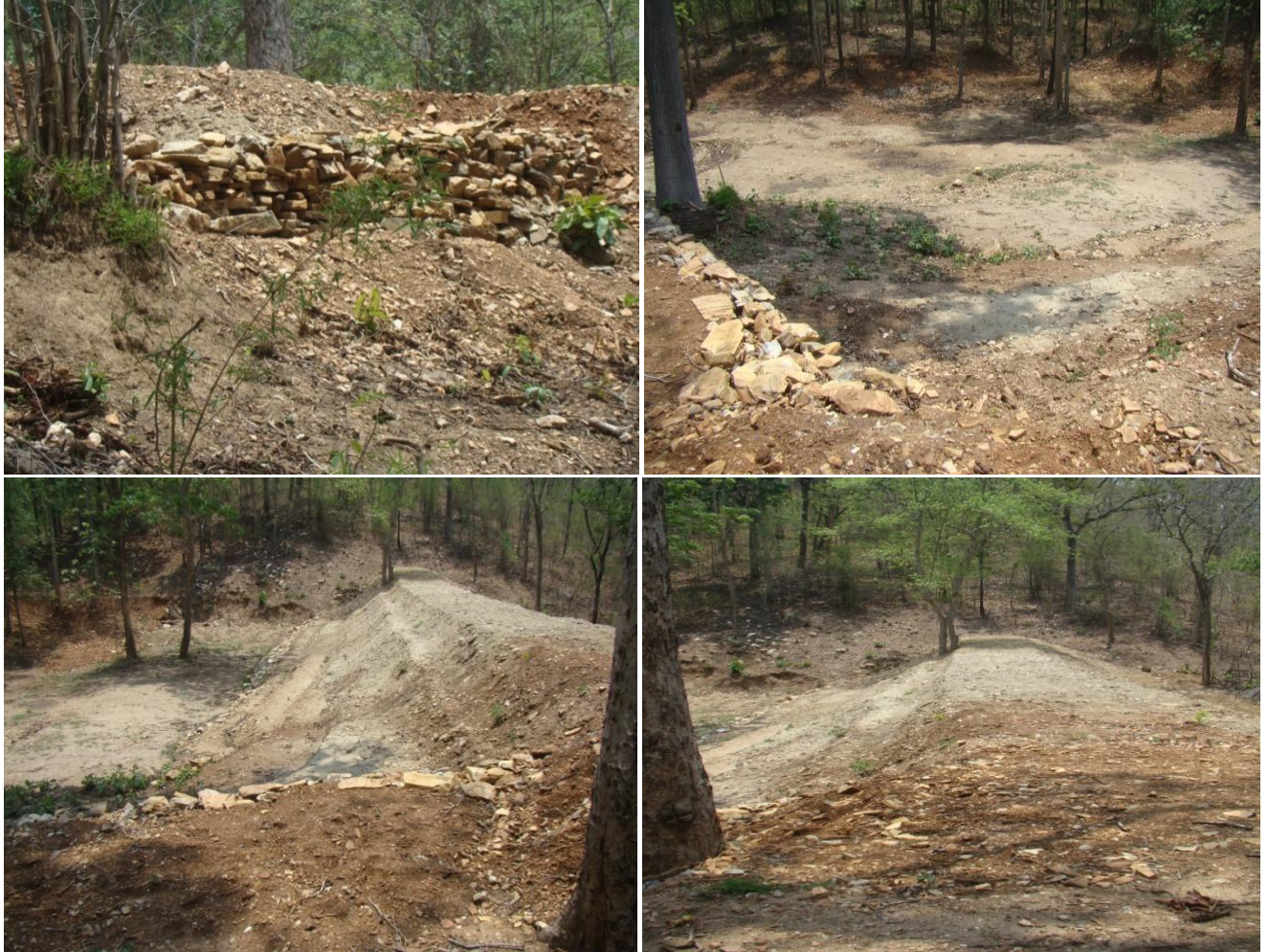
Fig. 6: Construction of check dam/pond - Site 5