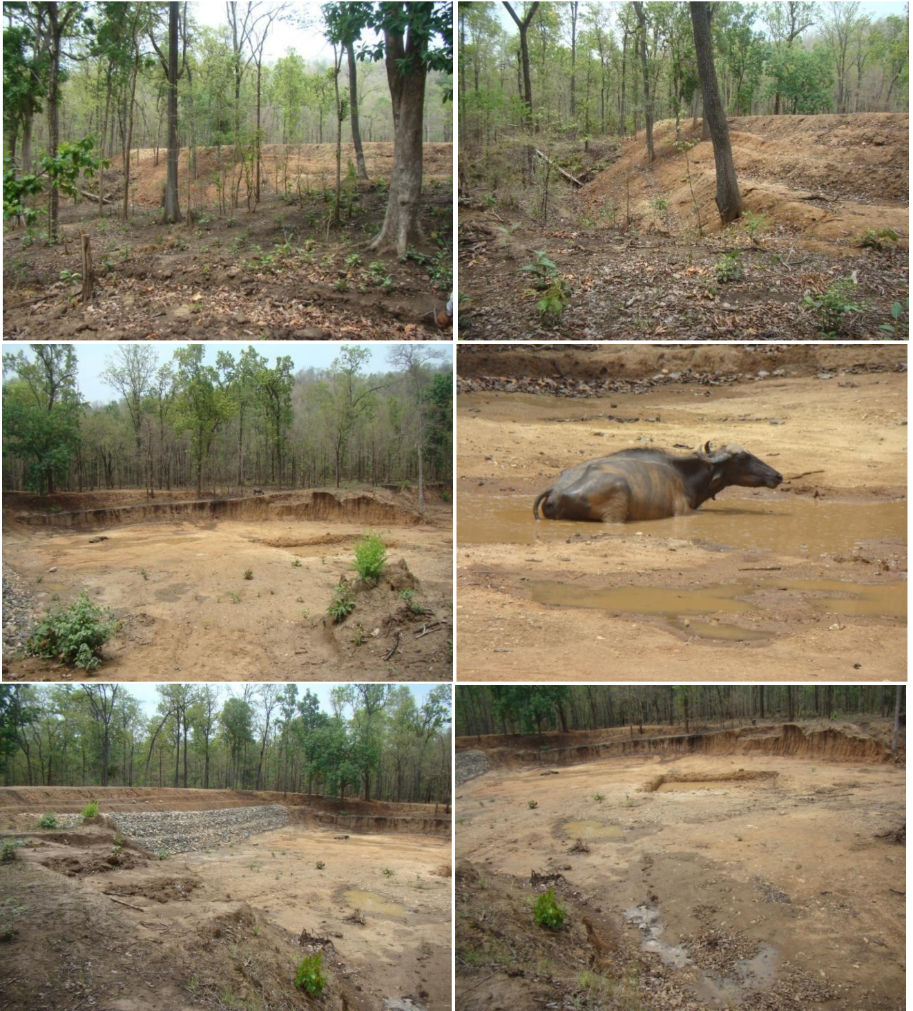
Fig. 8: Construction of check dam/pond - Site 7