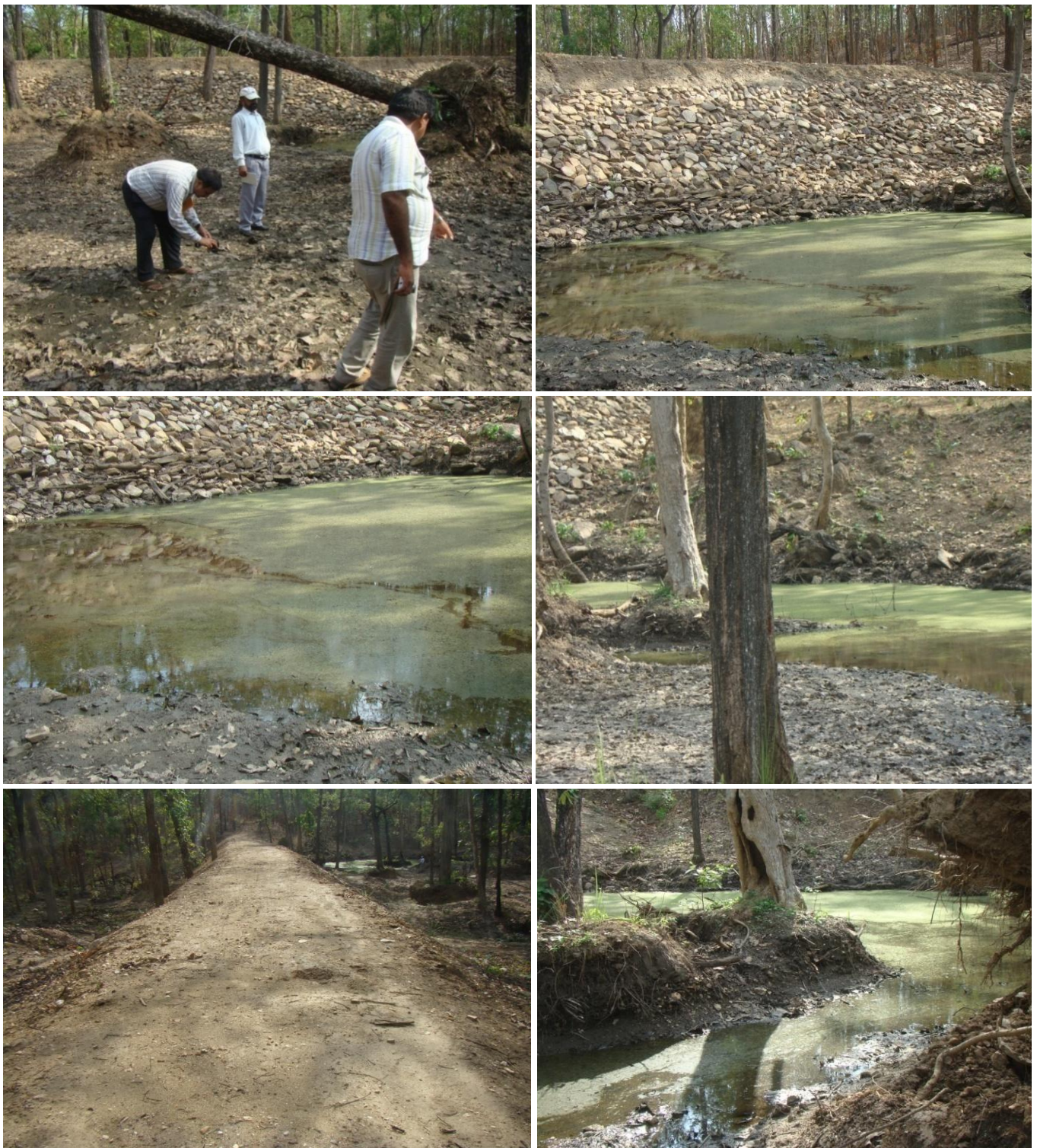
Fig. 3: Construction of check dam/pond - Site 2 (Photo dated 08.06.2016)

Range-Lamni, Beat- Chhirhatta, Compartment No. RF-341 Length-70 m and height-10 m (7 m above ground + 3 m below ground) Presence of mixed forest. Observed water source. Recorded pugmark of panther and other wild animals