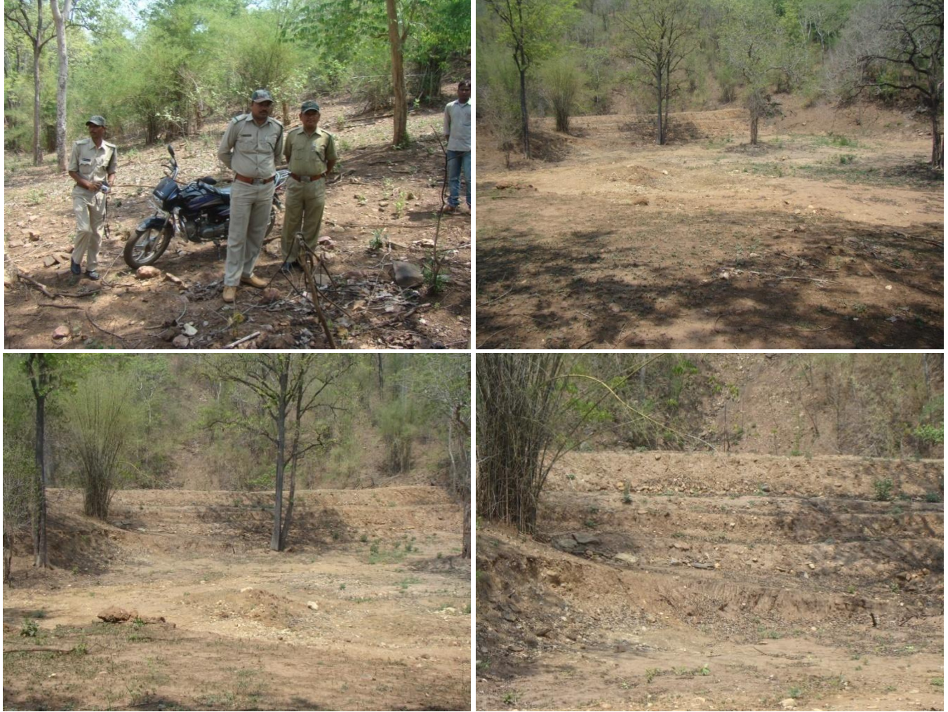
Fig. 4: Construction of check dam/pond - Site 3