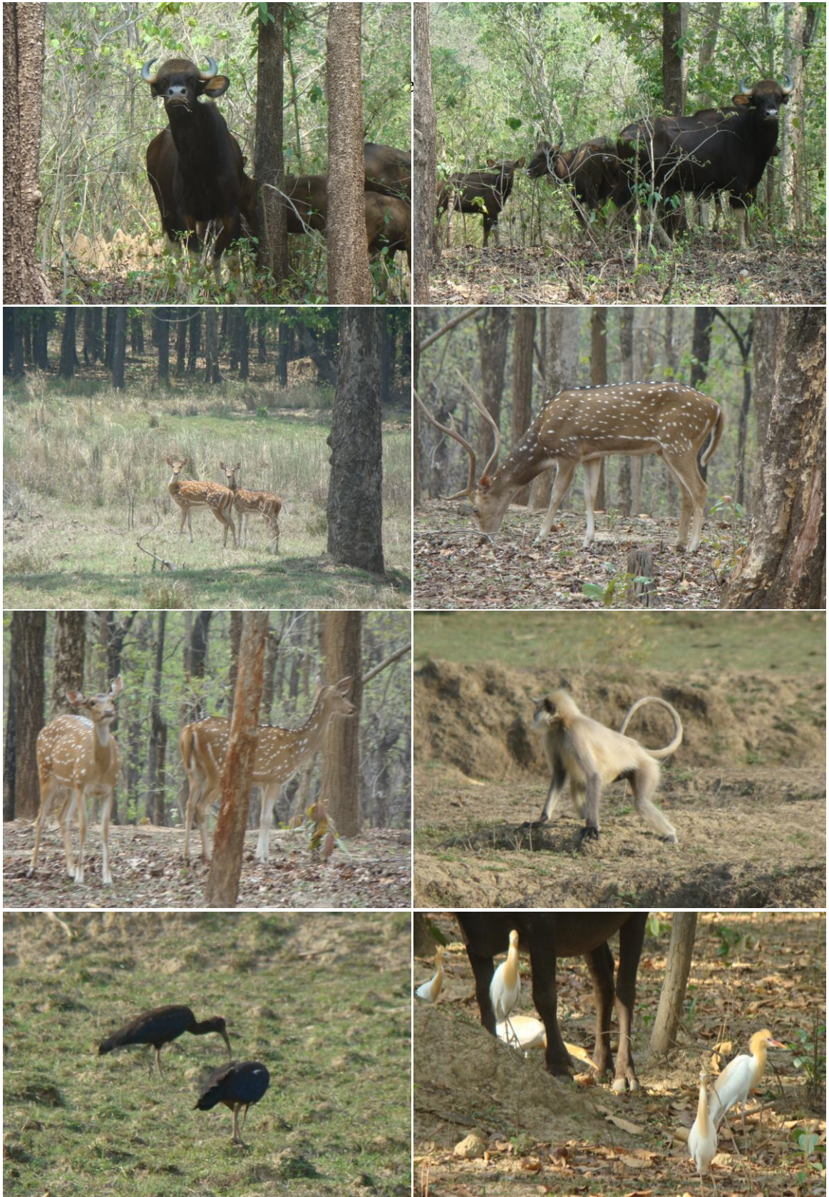
Fig. 9: Wild animals in and around the check dam/ponds in Achanakmar-Amarkantak biosphere reserve. (Photo dated 08.06.2016)