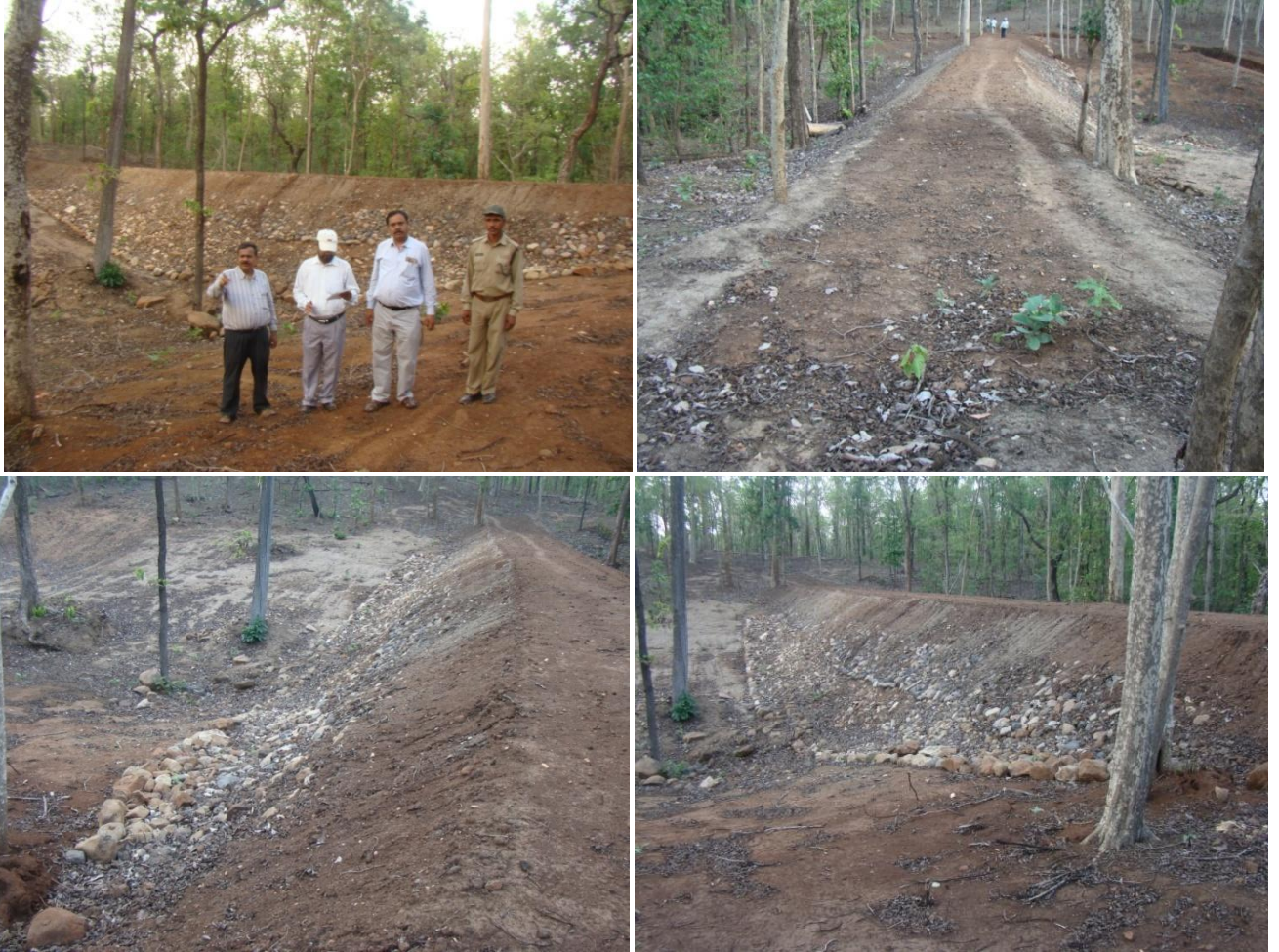
Fig. 2: Construction of check dam/pond - Site 1